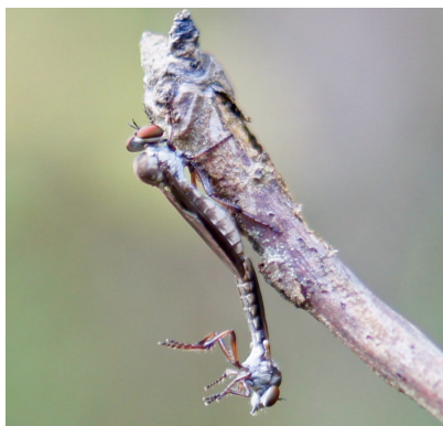
Fig. 5. Mating pair of Holcocephala calva in the tail-to-tail position with the female above and male hanging below (Photograph: D.S. Dennis, 30 September 2020, 8:37 AM).