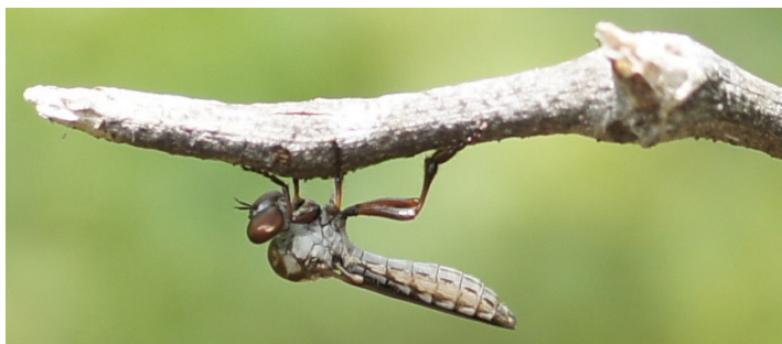
Fig. 2 Holcocephala calva in daytime and nighttime resting position (Photograph: D.S. Dennis, 3 July 2020, 1:39 PM).

Some H. calva spend the night on the same twigs where they rest and forage during the daylight hours. However, in the unnamed tributary to Moses Creek habitat most move down to slightly lower twigs 1.5-1.9 m above the ground. At night individuals are usually positioned on the top of or underneath the twig 1-17.5 cm (average 5.4 cm; n=11) from the tip, with their bodies held flat against the twig. They remain in this position until approximately 45-60 minutes after sunrise when they stand up and often groom their hind tarsi and tibiae before they start daily activities.