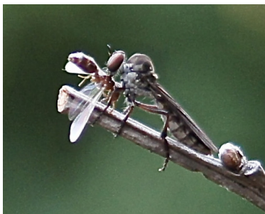
Fig. 4. Holcocephala calva with winged Pheidole navigans as prey (Photograph: D.S. Dennis, 23 June 2020, 7:01 AM).

The average length of 10 male and female H. calva is 8.5 mm. The average length of 88 prey is 2.4 mm with a range from 0.8-5.6 mm. This results in a mean predator to prey ratio of 3.5, which indicates that H. calva is approximately 3 1/2 times larger than its prey. Scarbrough (1982) said that the mean predator to prey ratios for H. calva and H. abdominalis is 3.7 and 3.4, respectively. The overall mean predator to prey ratio for both H. fusca , (Dennis, 1979) and H. oculata is 3.5 ( LaPierre, 2000). Mean predator to prey ratios for other species of robber flies range from 0.9:1.0 to 8.4:1.0 (Dennis, 2016), with an overall mean of 2.8.