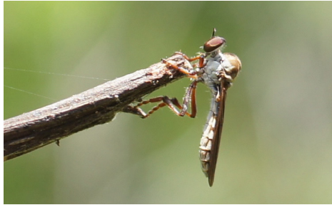
Fig. 3. Holcocephala calva in foraging position (Photograph: D.S. Dennis, 12 June 2020, 12:10 PM).

flights are made all around and generally at the same level as their perch. Only three orientation/investigatory flights were made 7.5-12.5 cm below their perch.