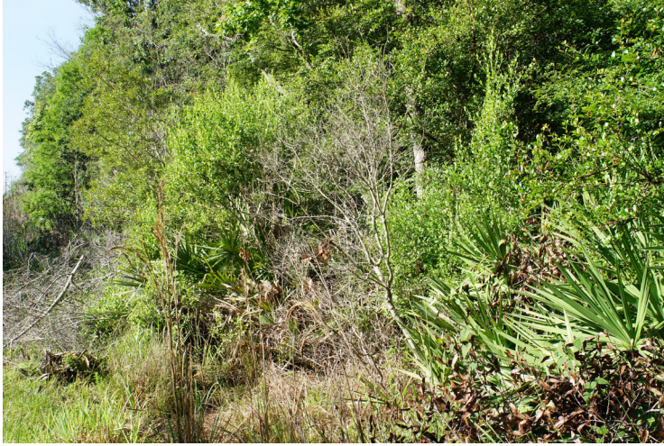
Fig. 1. Holcocephala calva habitat along road in Moses Creek floodplain (29 May 2020, 8:52 AM).