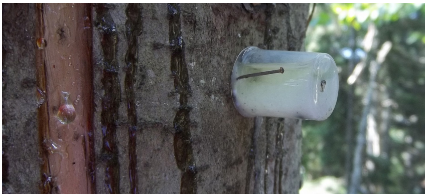
Fig. 2. Dendroctonus micans female drowned in resin.

Twenty-two (36.7%) adults laid eggs, 20 (33.3%) were drowned in resin (Fig. 2) and 18 (30%) were dead in plastic caps (Table 1). There were no drowned beetles at the control site. There were 1, 6, 6, 4 and 3 drowned beetles at sites 1, 3, 4, 5 and 6, respectively. Chi-square test showed that numbers of drowned beetles between sites were significantly different ( \chi^2 = 17.282 , df = 5 , p < 0.05 ). Proportions of adults that laid eggs were 0.6, 0.5, 0.3, 0.1, 0.3 and 0.4 at the sites, respectively. Beetles were more successful at the sites with higher phloem moisture (Table 2). Average phloem moisture was 49.2% at the sites where females laid eggs and 44.2% at the sites with no oviposition. Values were significantly different between these sites ( t test, t = 6.274 , p < 0.05 ).