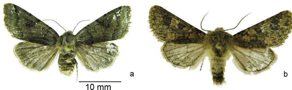
Fig. 1. Adult moths: a) female of Agrochola turcomanica ; b) male of Polymixis achrysa .

and slightly swollen. Corpus bursae much broad, nearly rounded, membranous but weakly sclerotised with three signa located at the distances far from each other.