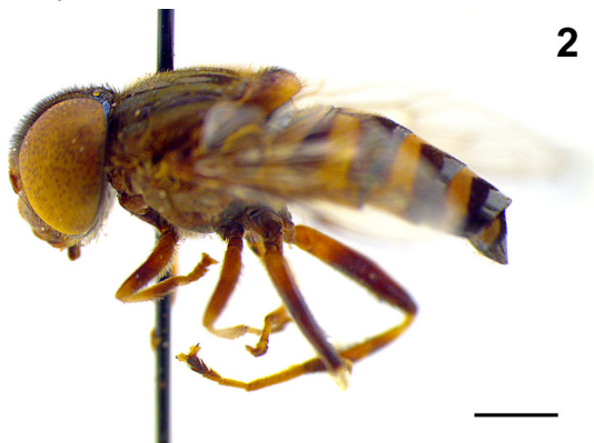
Fig. 2. Eristalinus (Lathyrophthalmus) madagascariensis (Hervé-Bazin, 1914), overall appearance, lateral view. Specimen collected on Réunion, France. Scale bar: 2 mm.

Notes. The studied specimen from Réunion was collected in an upland forest.