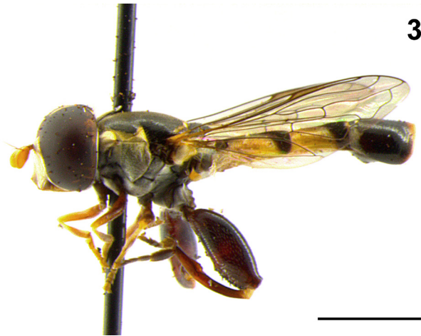
Fig. 3. Syritta austeni Bezzi, 1915, overall appearance, lateral view. Specimen collected on Réunion, France. Scale bar: 2 mm.