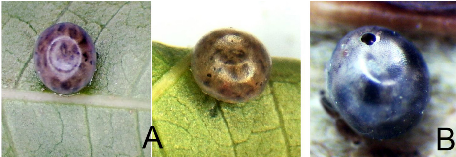
Fig. 3. A. Lepidopterous egg on poplar leaf, B. Parasitized egg with emergence hole.