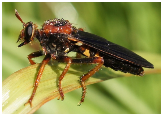
Fig. 3. Female Prolepsis tristis with early morning dew on thorax (Photograph: D.S. Dennis, 24 August 2012, 8:13 AM).

Prolepsis tristis spent the night on vegetation, generally 30-60 cm above the ground, in either a horizontal or vertical position with their head up. One female was observed in a horizontal position with early morning dew on her thorax (Fig. 3).