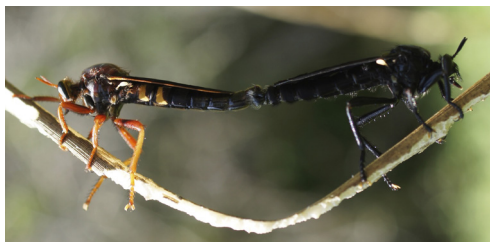
Fig. 1. Mating pair of Proleptis tristis in the tail-to-tail position with the female left and male right (Photograph: D.S. Dennis, 25 August 2015, 11:48 AM).

Proleptis tristis is 14-28 mm long and is dimorphic with the male and female differently colored (Fig. 1). In the MCCA the overall color of males is black to dark reddish brown with four variations in color observed on the abdominal segments as follows, (1) all black abdomen; (2) segments 2 and 3 with circular faint white to triangular bright white spots laterally; (3) in the bright white forms, the dorsal apex of the base of the triangle runs toward the mid-dorsal line, often coalescing there; (4) segments 4 or 5-7 mostly dorsally and laterally orangish to reddish brown with similar dorsal lighter spots on segments 2 or 3; (5) mesonotum of thorax reddish brown and an abdomen that is entirely black except the sides of segment 2 and the lateral posterior margins of segment 3, which are dark reddish brown.