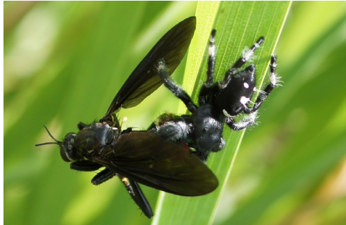
Fig. 5. Regal jumping spider ( Phidippus regius ) with male Proleptis tristis as prey (Photograph: D.S. Dennis, 20 August 2012, 11:25 AM).

Mites are often found on robber flies, in particular on the thorax. However, none were found on P. tristis .