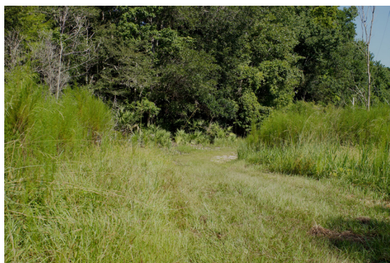
Fig. 2. Prolepsis tristis habitat along road in Moses Creek floodplain marsh (Photograph: D.S. Dennis, 24 August 2012, 9:27 AM).

The vegetation in the floodplain marsh community is thick, approximate 83 m long and 35.7 m wide, and is mostly along a “U” shaped road in an electrical transmission