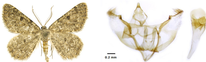
Fig. 5. Adult and male genitalia of Gnophos sacraria Staudinger, 1894 (Gp284)

Diagnosis: Wing span 23-25 mm in male, 25-26 in female. Antenna bipectinate. Palpus extremely small. Fore wing brown-greyish, finely and densely spotted with dark scales, and with indefinite traces of antemedial line, small but definite discal spot, postmedian line consisting of dots. Hind wing with the discal spot unclear, postmedial line same on forewing. Male genitalia : Costa of valva sclerotized, with a short and thick horn. Uncus well developed. Ventral arms of juxta long and two-pronged shaped. Dorsal arms of juxta short, enlarged and sclerotized. Aedeagus long and thickened near apex.