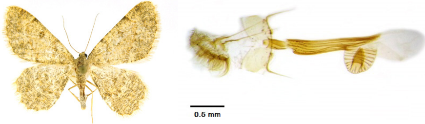
Fig. 3. Adult and female genitalia of Gnophos libanotica (Wehrli, 1931) (Gp2015-15).

and Niğde (Aladağları) Provinces (Riemis, 1998). It is new for the Lepidoptera fauna of Siirt Province and Şirvan district (Seven, 2014). The species inhabits humid area with intense Quercus and Astragalus plant species. For identification, the studies of Wehrli (1931) and Prout (1912-1914) were used.