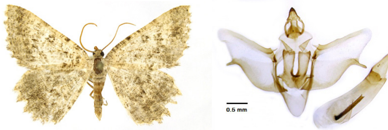
Fig. 4. Adult and male genitalia of Gnophos mardinaria Staudinger, 1901 (Gp456).

Diagnosis: Wing span 29-31 mm in male, 31-32 mm in female. Antenna thick and filiform. Terminal line on the fore wing, indistinct, dark brown. Medial line unclear, discal spot big and definite. The distal margin of the hind wing is deeply arched. Underside yellowish and characterized by having a broad blackish distal border to both wings. Male genitalia : Uncus broad and well developed. Sacculus sclerotized, at tip projecting outwards. Ventral (posterior) arms of juxta broad, at tip truncate and pronged. Lateral arms of juxta short and digitiform. Aedeagus large, robust, with a thin stick-shaped cornutus.