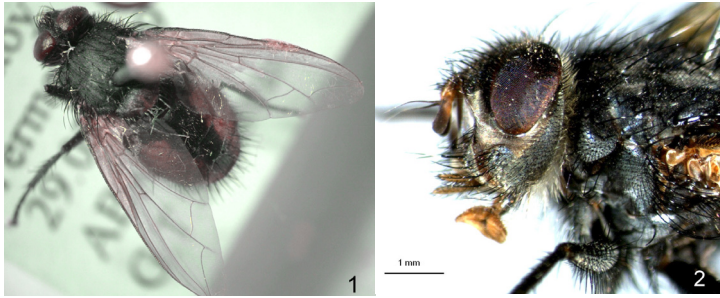
Figs. 1-2. Nemoraeea pellucida (Meigen) (♂): 1. Adult, 2. Head