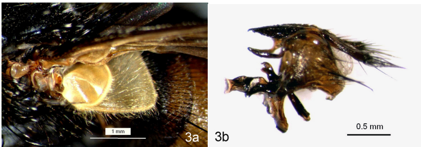
Fig. 3. Nemoraeea pellucida (♂) a. Calyptrae, b. Genitalia