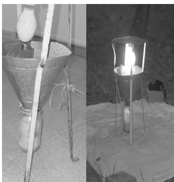
Fig. 2. Light trap.