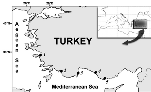
Fig. 1. Map of the studied area with sampling stations.

In September 2005, chironomid specimens were collected from Kalamaki (St.1), Fethiye (St.2), Antalya Bay (St.3,4) and Anamur (St. 5) using a quadrat sampler (20×20) (Fig. 1).